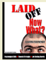
Laid Off Now What 2003

LATER: Receive the updated 2009 version for free (a $19.95 value!) when released this fall!